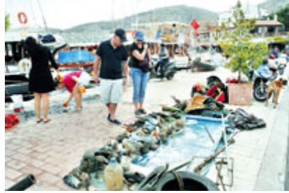
From car tires to plastic bottles, many astonishing waste was removed.

Datça, 3rd in the framework of Turkey's National Day of coastal, coastal and ocean floor was scrubbed. My Diving Center team of 12 people from Ankara Badi, Kargi bay dived in the morning. In the afternoon of Datca Center Harbor area is cleared. Tractor trailer full of garbage was removed.