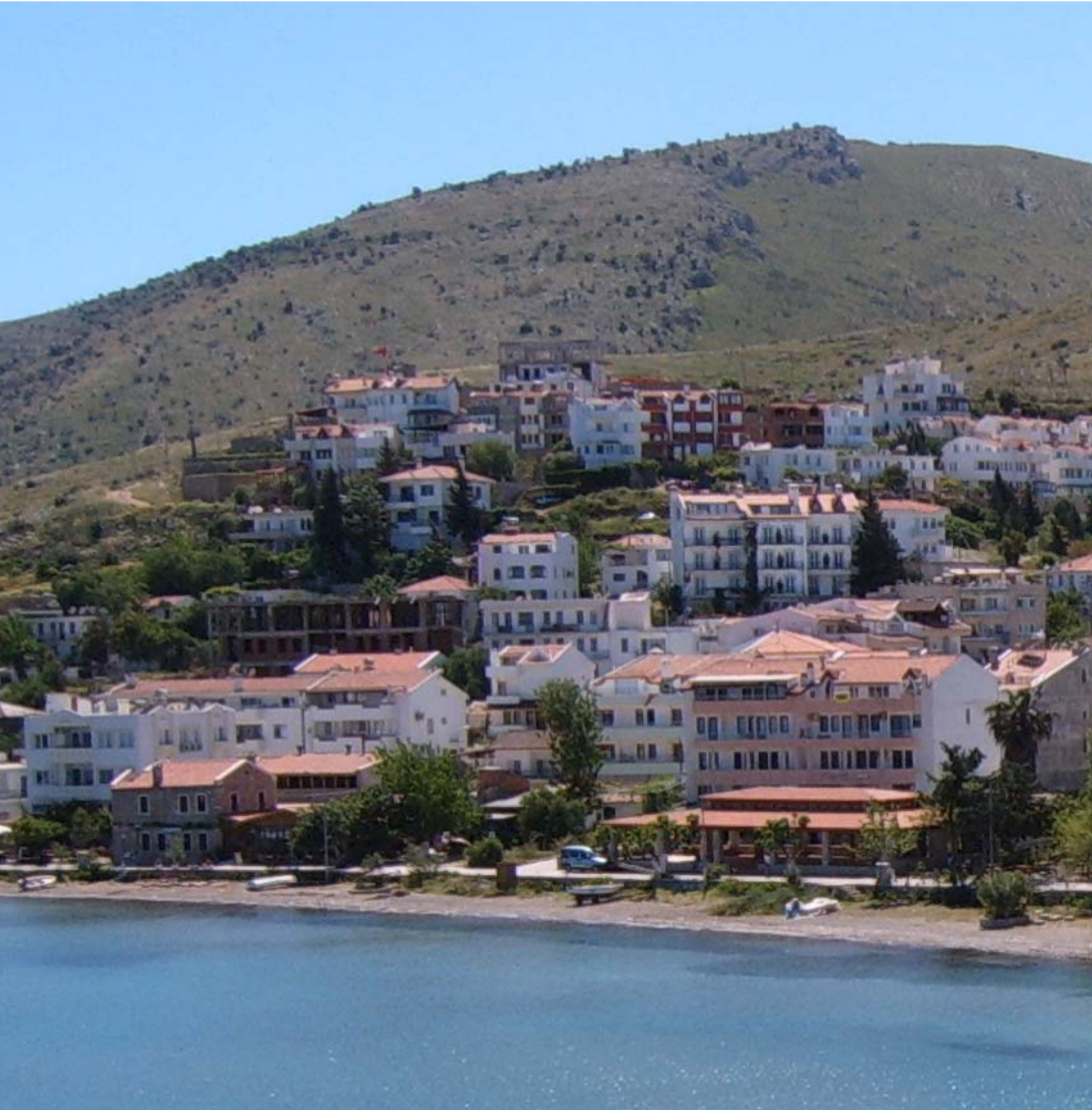
DATÇA, MUĞLA, TURKEY