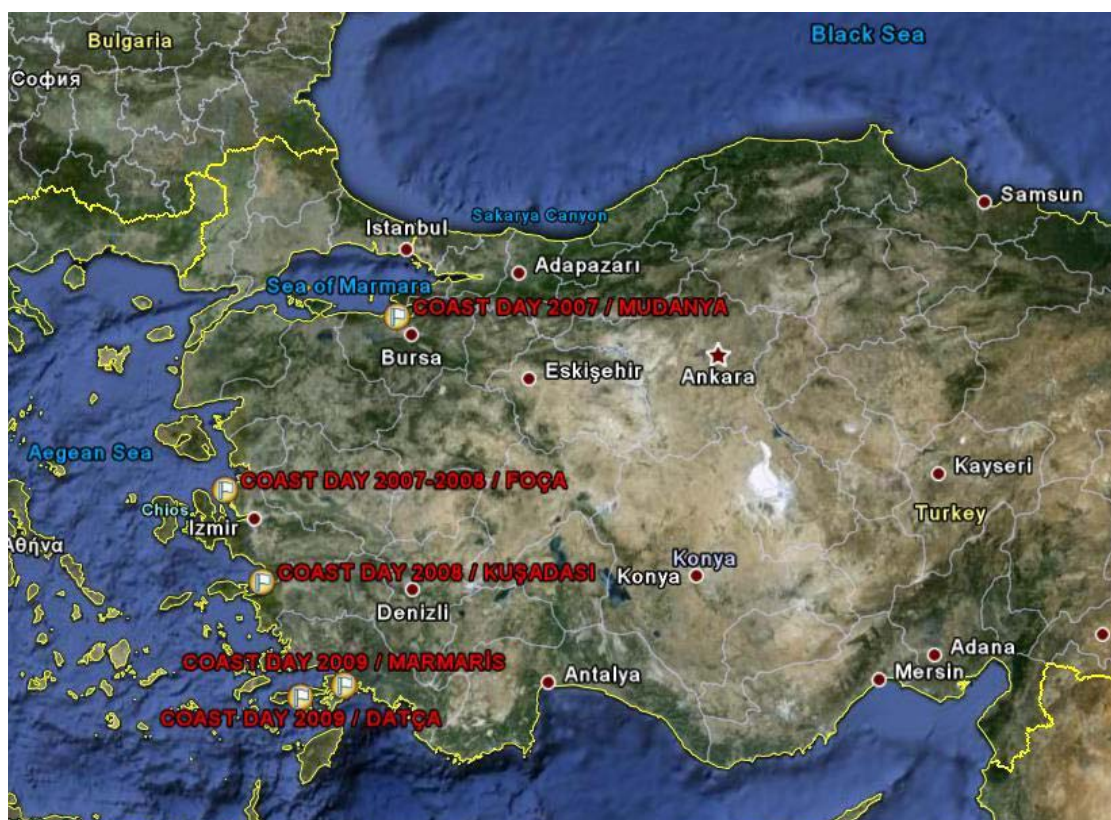
Map 1: GoogleEarth map showing the locations of the Coast Day activities between 2007 and 2009.

In 2008, the Ministry of Environment and Forestry started to lead the Coast Day organizations in Turkey and the Environmental Impact Assessment and Planning General Directorate, the national focal point of PAP/RAC, started to organize the annual activities. The General Directorate organized a meeting in Ankara (the capital city of Turkey) in order to establish a National Coast Day Organizing Committee and to take support from the relevant institutions before the 2008 Coast Day activities. After the meeting, an approach based on representativeness at the central level and activity-partnership at the local level was adopted in order to organize the celebrations.